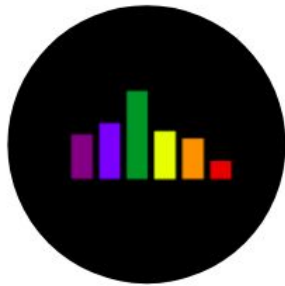
Paske buyer app