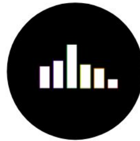
Paske operator app