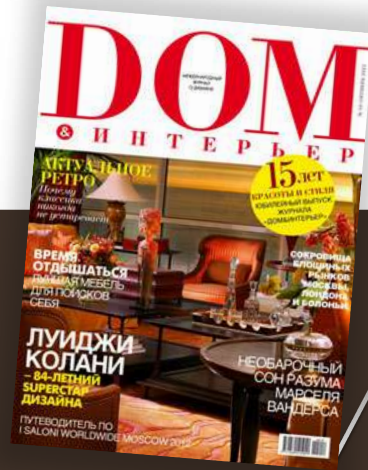
HOME & INTERIOR