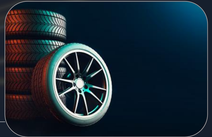
TIRES & WHEELS