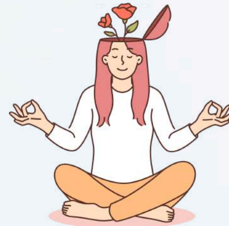
Reach Deep Relaxation

Classical Harmony creates an atmosphere that immerses viewers into a state of total relaxation, with classical music complementing the process. Rather than giving viewers any superfluous information, It leaves them to observe the most outstanding paintings and listen to soft classical music. This way they can fully concentrate on art and not get distracted. The product helps to relax and free your mind. The sound and form of the universal beauty is seen harmoniously in the works that the channel represents.