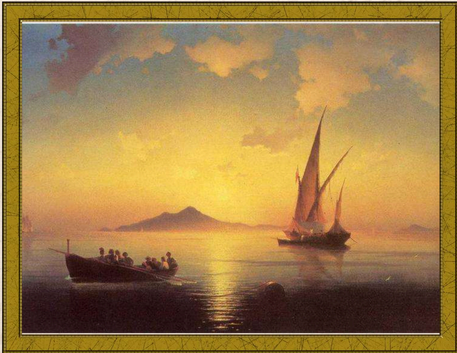
Ivan Aivazovsky. The Bay of Naples, 1841