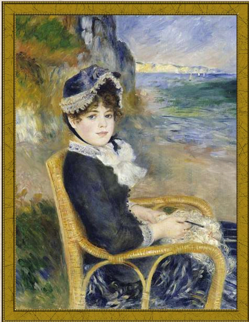
Pierre-Auguste Renoir. By the seashore, 1883