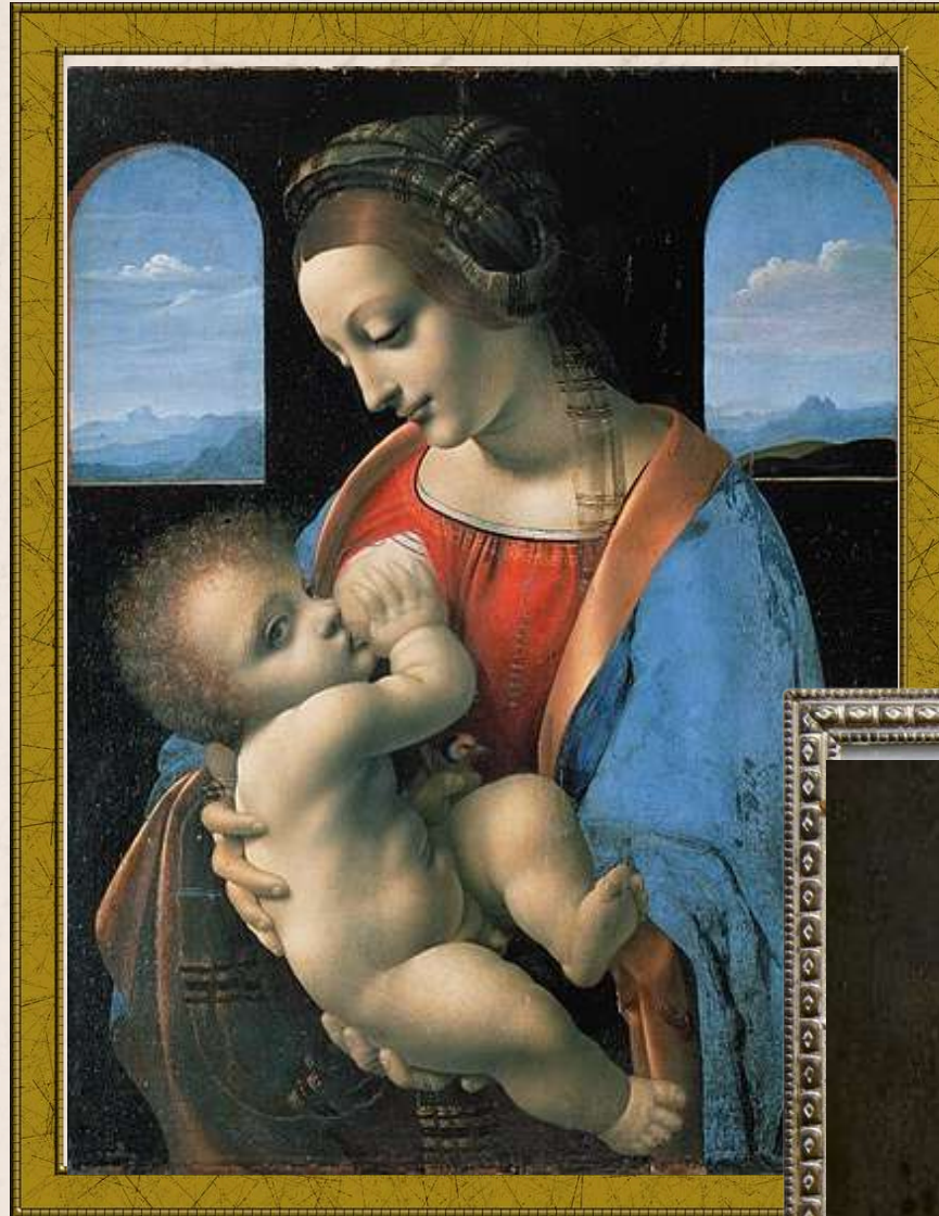
Leonardo da Vinci. Madonna Litta 1490

MAIN FEED It includes all the content produced by the Classical Harmony team.